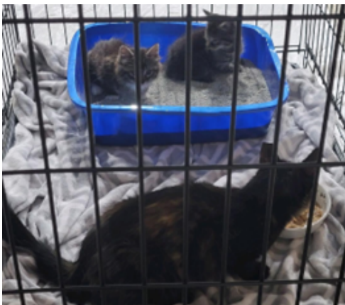
Birdie and her boys (Happy and Winky)

In May 2023, we became aware of a female cat who had kittens in a neighbor's yard. The neighbor was not familiar with cats and reached out to local rescues for help, but volunteer resources at the rescues were at maximum capacity. We contacted the neighbor and offered help. Together, we provided food and shelter for mama and her two kittens in the neighbor's yard until the kittens were old enough to be separated from their mama so that she could be spayed. We transitioned all three to a catio on our screened in porch until all three were spayed/neutered. They now are free to come and go while always having access to food and shelter.