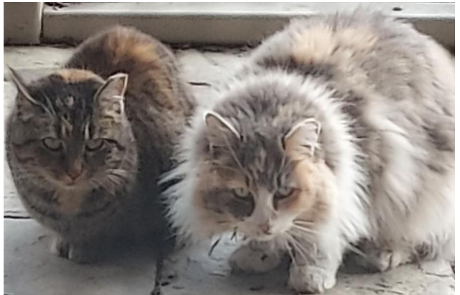
Mama Calico and her best friend Tortie

For years we have cared for five outdoor cats who made their home in our backyard. We converted our screened in porch to their sanctuary, including individual houses that are heated during the colder months. We feed them and interact with them daily. All have been spayed/neutered. One of the cats, Mama Calico, was in need of dental care in 2022. We brought her inside our home for a month so that she could have the dental surgery needed and time for recovery from the surgery. While Mama Calico was an agreeable patient, it was apparent that her desire was to be outside running free. So, she returned to the outdoors where she has food, shelter and the freedom to come and go as she pleases.